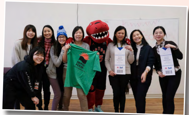
A special visit from Raptor, sharing Raptors game tickets with Hong Fook

Last but certainly not least, the Lunar New Year is fast approaching! For me, this usually means getting together with some friends, seeing family and making sure there's plenty of delicious food to share together! The Asian diaspora is broad and many of us are looking forward to celebrating with our family and friends whether here in Canada or abroad. Wherever you end up this year, I hope the Year of the Dragon brings you meaningful connection, good health and happiness to you and your loved ones.