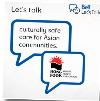
Hong Fook profiled as one of the featured charities in the Bell Let's Talk campaign

Bell Let's Talk has been a sustained supporter of our Recovery College, and this year, we were awarded with a generous grant of $100,000. We are so grateful for the ongoing support and for the incredible work the Recovery College peer supporters and staff team have done to co-create recovery journeys that help people in our community thrive.