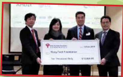
Appreciate the continuous support from Canada Chinese Computer Association for donating $10,000 to Hong Fook.