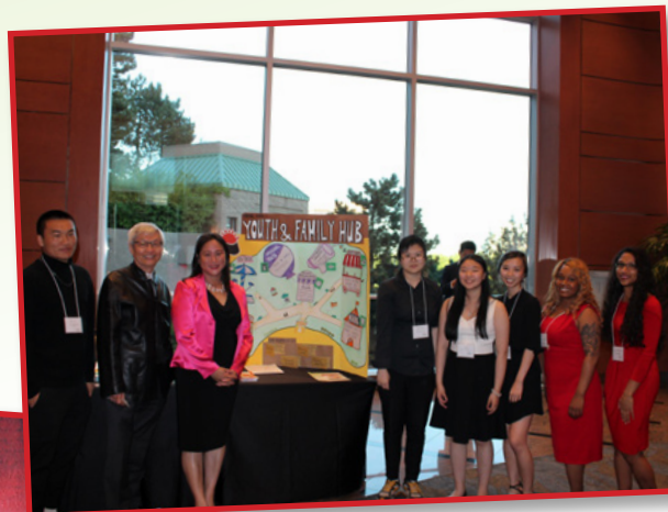
Hong Fook youth volunteers showing their Hub model.

After the Gala, the Foundation has secured another donation of $15,000 from the Scarpitti Foundation to build a digital corner at the Markham Youth and Family Hub.