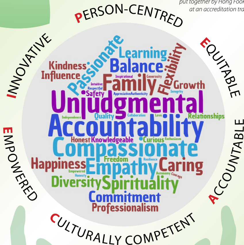
Word cloud of common values put together by Hong Fook staff at an accreditation training